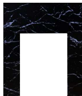
Includes black / white reversible marble effect laminate panel